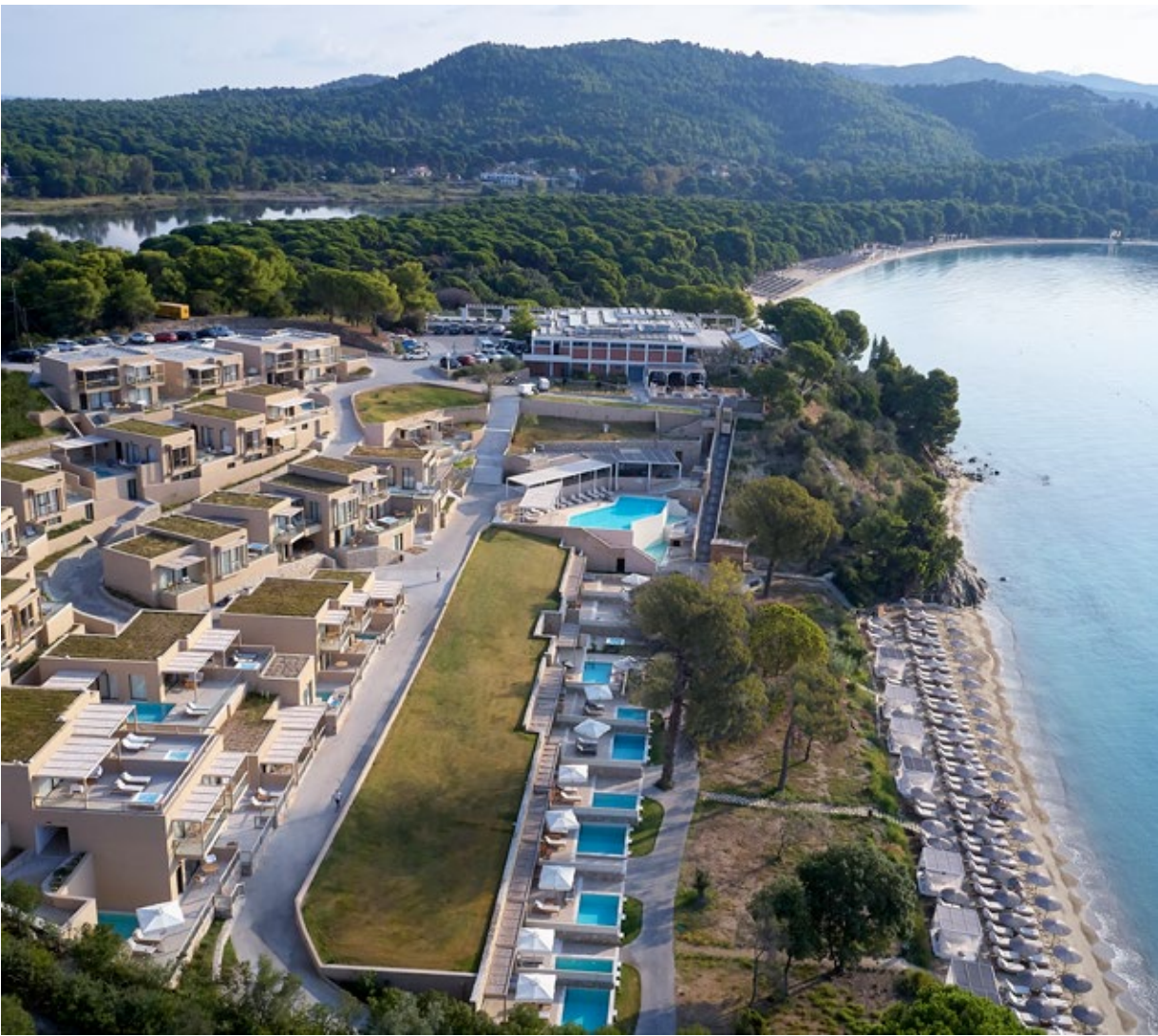
ELIVI GRACE Rooms & Suites

ELIVI GRACE ROOMS & SUITES | 68 ROOMS AND SUITES, PLACED WITH MODESTY AND COMPLETELY ADAPTED TO THE ENVIRONMENT, FOR GUESTS WHO WANT THE SOUND AND THE VIEW OF THE SEA, INCLUDING 11 BEACHFRONT SUITES WITH PRIVATE POOLS LITERALLY TOUCHED BY THE WHITE SAND OF AMBELAKIA BEACH.